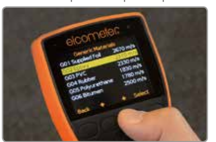
Easy to use and minimum set up required