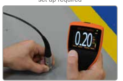
Rugged and reliable, ideal for harsh environments